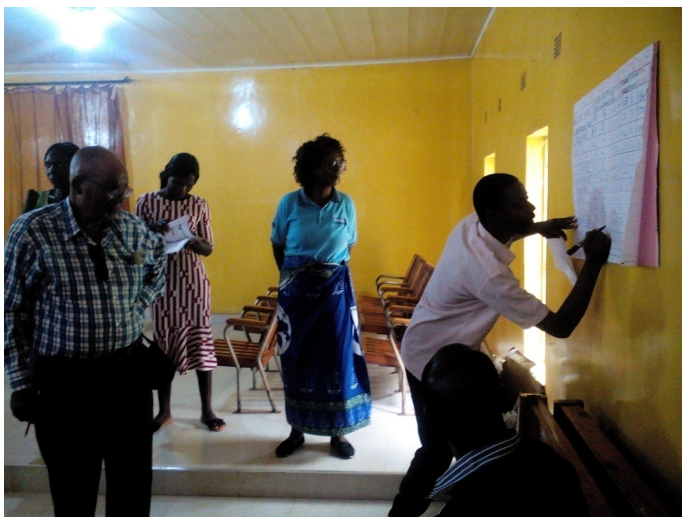
During presentations by participants.