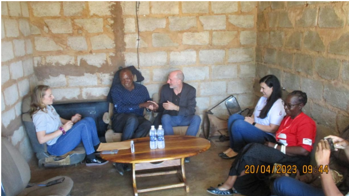
Inside the office for Nampundwe Trust Group with Headman sitting next to the Director

Earlier, we had passed through the Nampundwe Mine. But because the mine premise is highly restricted, and we did not have a permit, we never bothered to stop. We proceeded to the headman's residence for a courtesy-call.